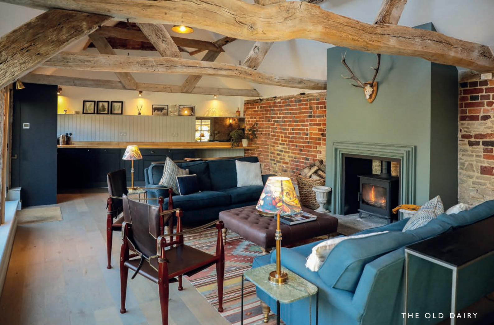
THE OLD DAIRY